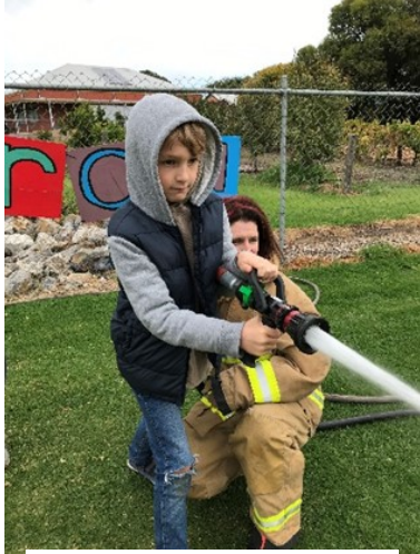
A visit from the CFS

"The world is but a canvas to the imagination." – Henry David Thoreau