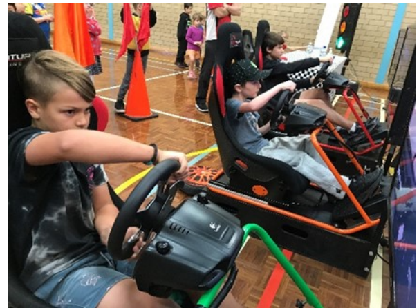
Rev it up racing