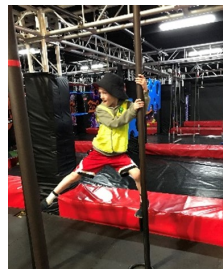
SA BASE CAMP NINJA WARRIOR