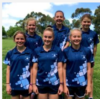
GIRLS TEAM (2)