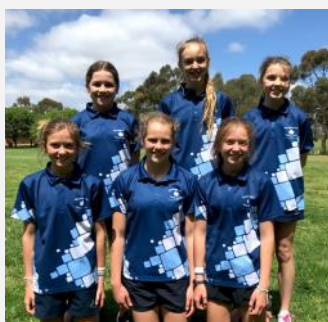
GIRLS TEAM (1)