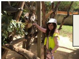
URIMBIRRA WILDLIFE PARK

AS ANOTHER SCHOOL YEAR HEADS RAPIDLY TOWARDS ITS CLOSE, WE ARE ASKING ALL FAMILIES TO FILL OUT A NEW ENROLMENT FORM AND BOOKING SHEET FOR 2020. ENROLMENTS WILL NOT AUTOMATICALLY CONTINUE OVER INTO THE NEW YEAR. WE ARE ALSO NEEDING TO UPDATE EVERY CHILD'S MEDICAL RECORDS, INCLUDING ACTION PLANS AND MEDICATION. IF YOU HAVE ANY QUERIES, DON'T HESITATE TO POP INTO OSHC AND TALK TO ONE OF THE OSHC STAFF.